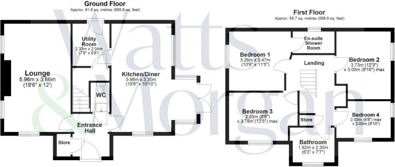
Total area: approx. 117.6 sq. metres (1265.5 sq. feet)

A neat forecourt garden fronts the property with a central path dividing two pebble beds bordered by low box hedging. The driveway, to one side, has space for 2 cars end to end and leads to the garage (approx. max 6.5m x 3.2m). Access to garage with up and over door; power connected. The rear garden area is a lovely enclosed low maintenance space featuring a paved patio seating area and astroturf lawn edged by railway sleepers and white pebbles. There is an additional deep storage area to the rear of the property and accessible from the garden, ideal as additional storage area.